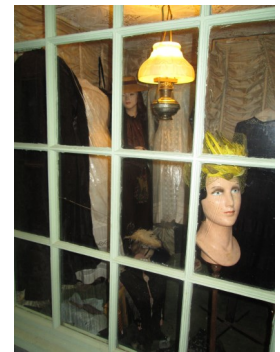
Please Adopt Us!