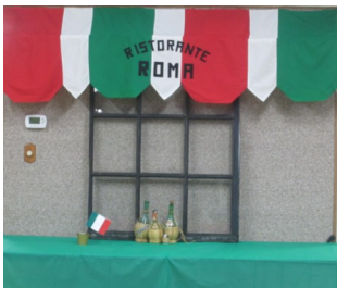
Decorations from our Italian Program on July 21, 2016

Bank. Pasties, brats and hot dogs will be on the menu along with games and lots of fun!